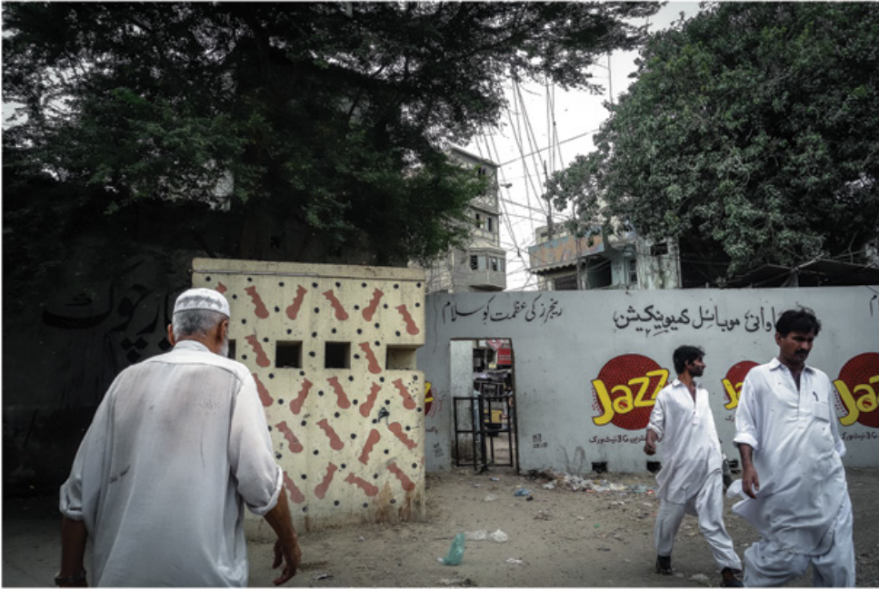
FIGURE 2 A boundary wall between the SITE industrial area and the working-class locality of Bawani Chali

double as advertising space, with local industrialists hoping to partly cover the cost of their security system through its commercialization (see figure 2). At the few walls allowing pedestrian traffic, residents on their way to the industrial area must submit to security checks by the Rangers Security Guards (RSG), a ‘private’ security company registered by the paramilitary force of the Sindh Rangers in 2012. At the gates of these checkpoints, heavily armed RSG personnel randomly request CNICs. Although these are technically ‘private’ guards, residents of Bawani Chali and adjoining neighborhoods do not distinguish between them and the Rangers, who officially come under the authority of the Federal Interior Ministry but who are commanded by senior officers of the army (Gayer, 2010). The Rangers were called in at the end of the 1980s to help the police restore order in the city and, since then, have seen their workforce increase continuously, in parallel with their policing powers (Waseem, 2019). Since 2013, the Rangers have been leading anti-crime and anti-terrorism operations, through which they have strengthened their relationship with the local business community.