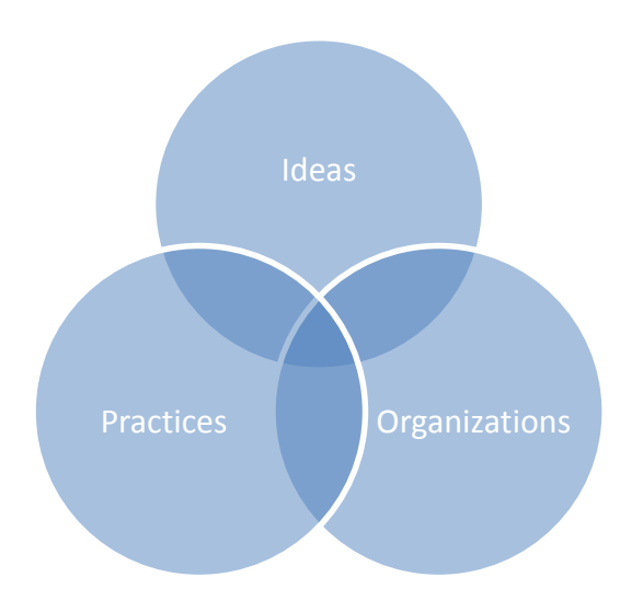
Figure 1. Organizing ideology.

Organizing ideology includes more than an organization's political orientation (left/right) but also its strategy for social change (radical/reformist). I observed in my interviews and ethnographic work that ideology involved more than political leaning. An organizing theory, or political strategy for social change, differed between the two unions and factored into their online engagement, whether radical or reformist. I also found a strong relationship between ideas around their political orientation and strategy and their practices .