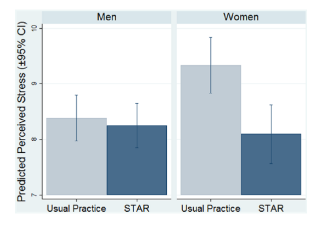
Figure 1b. Predicted Perceived Stress at Wave 3 by STAR and Gender, Early Survey Group

by contrast, experienced increased psychological distress over this period (black dashed line), which appears to be the main reason why we find a particularly large STAR effect for women without children at home. In further analysis, we find women without children at home were older (average age of 50 versus 44 to 48 for the other groups), much more likely to be single (41 percent versus 3 to 23 percent), and more apt to have adult care responsibilities (31 percent versus 20 to 25 percent). We speculate that the increased distress of women in the control group may reflect the challenges and vulnerabilities of older women in highly demanding jobs with less control over their time, but this is the case for only one well-being measure; analyses of the three other outcomes found no