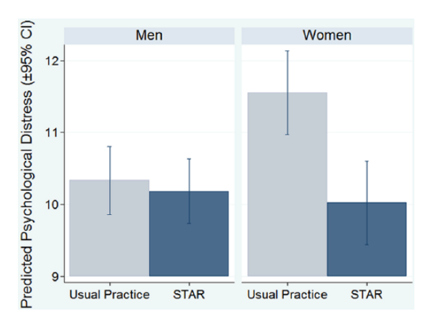
Figure 1a. Predicted Psychological Distress at Wave 3 with 95% CIs by STAR and Gender, Early Survey Group