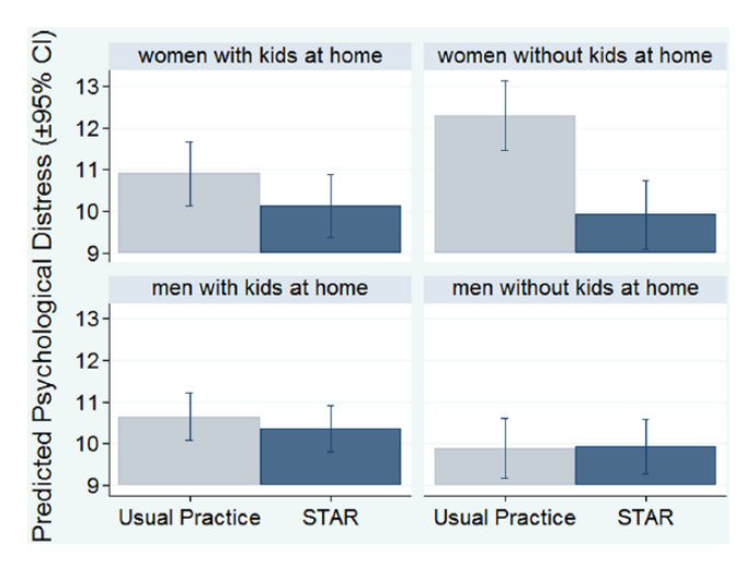
Figure 2a. Predicted Psychological Distress at Wave 3 by STAR, Gender, and Family Caregiving Context, Early Survey Group