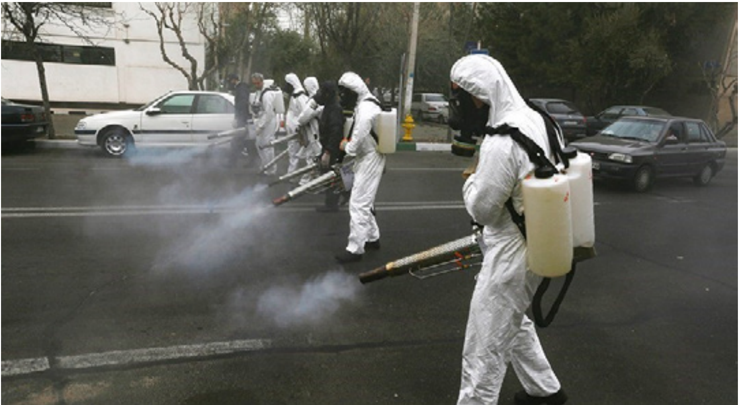
Disinfection of public and urban thoroughfares in Tehran's Nabrud neighborhood, March 2020

"This failure manifested itself in three areas: managerial capability, social philosophy and morality.... The spirit and basis of the social philosophy of the west rests on materialistic motives. For this reason, they have ignored the elderly, the sick, the poor and individuals with various disabilities, because such groups of people do not have the capability to earn money and generate wealth. For this reason, many have died in nursing homes. This reality vividly exhibits the failure of the western social philosophy." 28 This climate of media confrontation has effects on Iran's ability to benefit from international cooperation to combat the pandemic. Indeed, because of these conspiracy theories, the Islamic Republic refuses any US humanitarian aid—in principle because of the hostile nature of US actions. 29 And therein lays the Iranian specificity in relation to the Chinese and Russian accounts of the pandemic. Indeed, for Beijing and Moscow the anti-US ideological dimension in the construction of their media narrative does not take precedence over their economic interests. In the case of Iran, it is the ideological vision that determines the nature of relations with Wash-