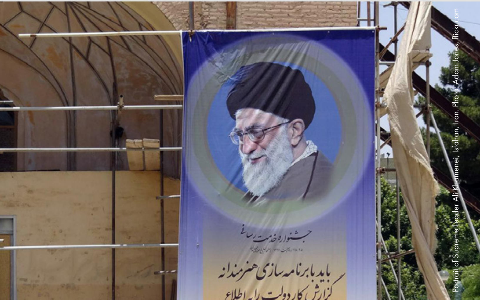
Portrait of Supreme Leader Ali Khamenei, Isfahan, Iran.