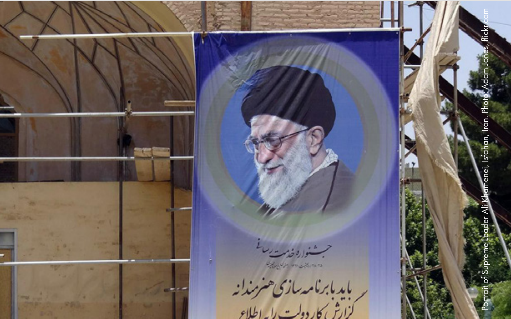
Portrait of Supreme Leader Ali Khamenei, Isfahan, Iran.