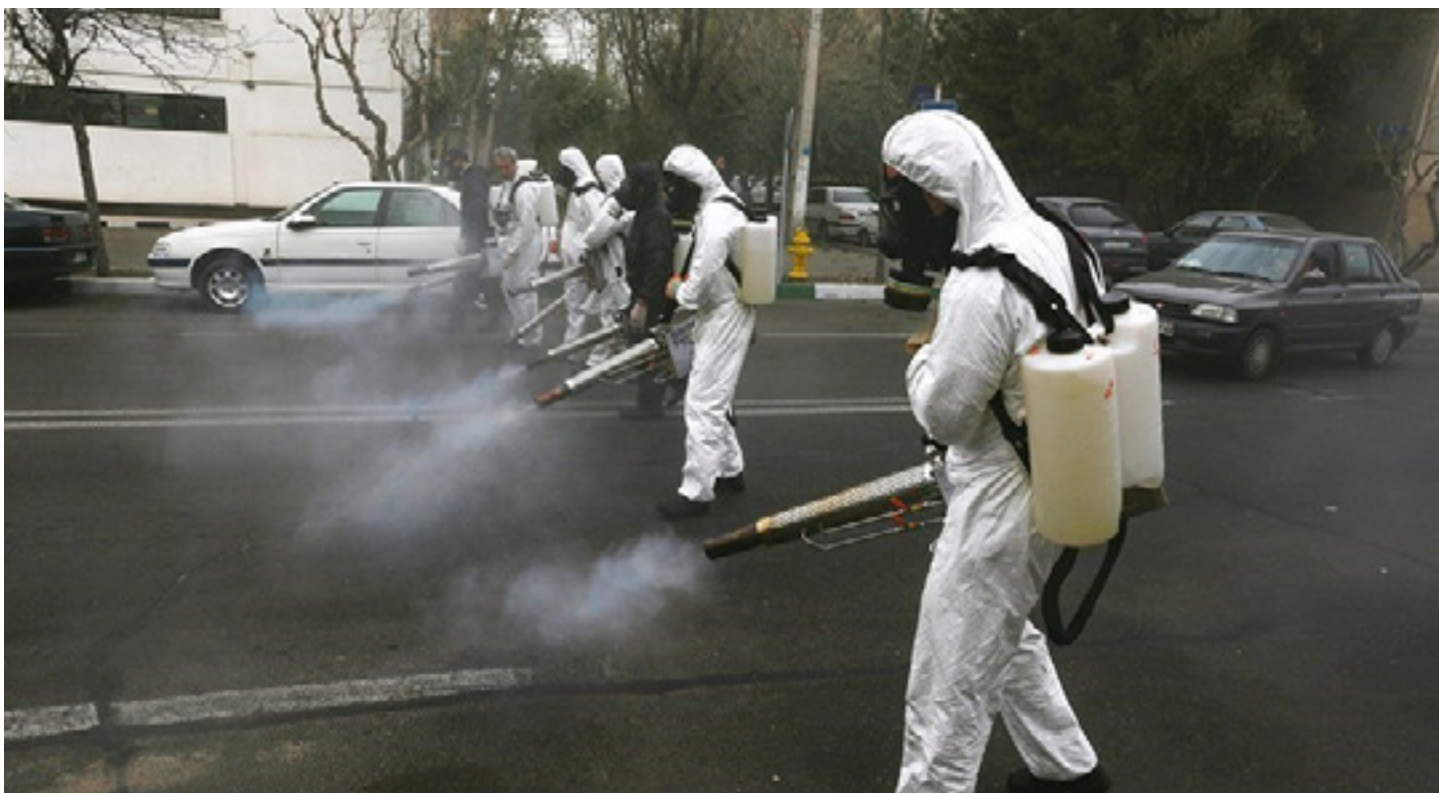
Disinfection of public and urban thoroughfares in Tehran's Nabrud neighborhood, March 2020

"This failure manifested itself in three areas: managerial capability, social philosophy and morality.... The spirit and basis of the social philosophy of the west rests on materialistic motives. For this reason, they have ignored the elderly, the sick, the poor and individuals with various disabilities, because such groups of people do not have the capability to earn money and generate wealth. For this reason, many have died in nursing homes. This reality vividly exhibits the failure of the western social philosophy." 28 This climate of media confrontation has effects on Iran's ability to benefit from international cooperation to combat the pandemic. Indeed, because of these conspiracy theories, the Islamic Republic refuses any US humanitarian aid—in principle because of the hostile nature of US actions. 29 And therein lays the Iranian specificity in relation to the Chinese and Russian accounts of the pandemic. Indeed, for Beijing and Moscow the anti-US ideological dimension in the construction of their media narrative does not take precedence over their economic interests. In the case of Iran, it is the ideological vision that determines the nature of relations with Wash-