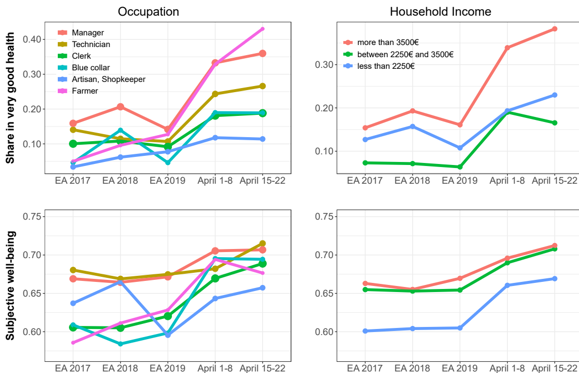
Figure 3. Sources: Coping with Covid-19 – 1st & 2nd wave (CoCo-1 & 2), April 1-8 & 15-22 2020, Annual Survey 2017, 2018, 2019, ELIPSS/CDSP N=834. Reading: The green line in the top left panel shows that 10% of clerks reported being in “very good” health in the 2017 survey and almost 20% in the latest survey. The left column plots time trends by occupation and the right column by tertiles of disposable household income. The upper row plots the share of respondents who report being in “very good” health and the lower row shows the evolution of the subjective well-being index. This index is an average of six questions that touch upon feeling nervous, discouraged, relaxed, sad, happy and lonely. The answers are normalized to be between 0 and 1, with 0 indicating the lowest and 1 the highest possible well-being level.

lockdown-related stress (“Has the lockdown taken a toll on you?”, measured on a 0-10 scale), a measure which has been rather stable over the first two waves of our survey. More than anything else, lockdown-related stress reflects workload and how often one is able to leave home. Those who work remotely from home and rarely go out are at particularly high risk of lockdown-related stress. For teleworkers who leave home only once a week or less, each additional hour of daily work means an increase of stress levels by around 4%. Nevertheless, going out more frequently is not a panacea for dealing with lockdown-related stress. Here again there appears to be a trade-off. For those who are teleworking, the positive boost to their psyche of going out seems to far outweigh the risks. For the rest of the population, however, the opposite appears to be true, and they experience an increase in stress levels the more they go out.