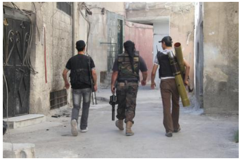
Free Syrian Army fighters carry their weapons to the frontline in Damascus.

Counterterrorist and counter-radicalisation policies not only have the potential to undermine the democratic principles, institutions, and processes they seek to preserve but also to produce unintended consequences.