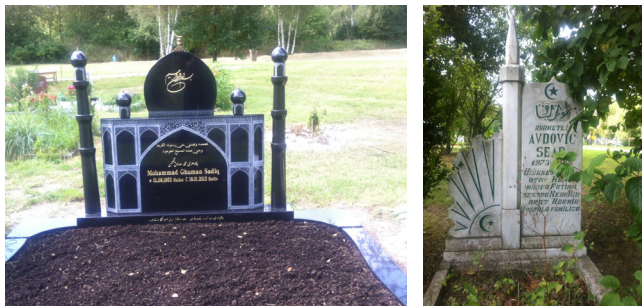
Figures 6 and 7: Mosque Graves

Finally, one of the most visually striking features of Berlin's Islamic cemeteries are tombstones resembling mosques. The domed mosque with its pointy minarets might very well be the most widely recognized symbol of Islam. The mosque grave brings the mosque—a place of collective worship that might be located near or adjacent to a burial ground—into the heart of the cemetery itself, albeit in miniaturized form. Beyond the conspicuous visual effect generated by the existence of mini mosques scattered among the mortuary landscape, the mosque grave occasions a socio-spatial reorientation for worshippers and mourners. The lines between sites of worship, pilgrimage, and prayer become blurred as the gravesite is re-imagined as something more than a place for the deposition of human remains. The dead Muslim body, which endows the soil with Islamic qualities, is directly linked to the most recognizable symbol of Islamic faith. The proximity of the mosque to the dead also mimics the medieval Christian practice of burying the dead directly under the grounds of the church. This practice, usually reserved for the rich or the holy, is given new lease in the diaspora cemetery. If you can't bury under the mosque, why not build a mosque over your grave? (see figures 6-7).