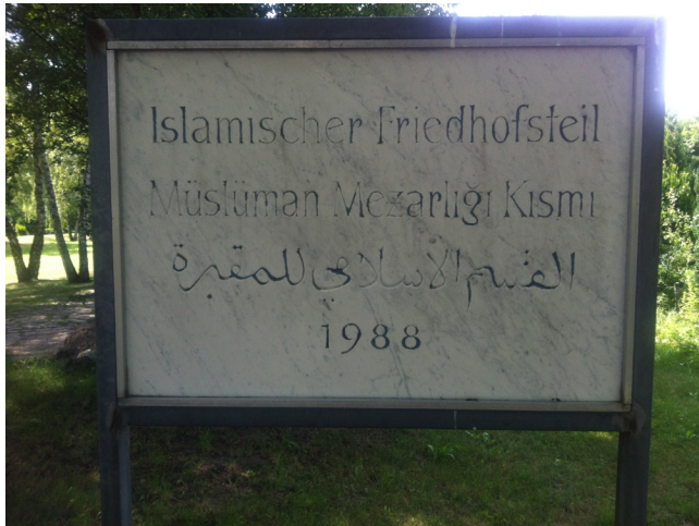
Figure 1: Multilingual sign marking the Muslim burial section of Landschaftsfriedhof Gatow, Berlin, Germany

changing contours of political membership, belonging, and identity in an increasingly multicultural society. Moreover, they are sites where members of ethno-religious minorities assert and display their long-term communal presence and in the process, help normalize symbols of ethnic, religious, linguistic diversity in contemporary Germany.