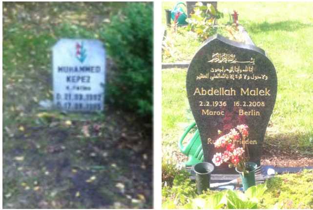
Figure 2 ("R. Fatiha") and Figure 3 ("Maroc / Berlin")

text on these grave markers is not in German. Of the tombs surveyed, 77 percent have monolingual inscriptions in Turkish, Arabic, or Bosnian. The remaining 23 percent incorporate text in two or more languages, including German. Although multilingual messages are present in some of the earliest graves surveyed here (from the 1990s), they are more numerous from the 2000s forward, reflecting a trend towards linguistic syncretism (see figure 3). Biographical information is conveyed through short inscriptions that contain a family's genealogy, kinship terminology, places of birth and origin, and occasionally information about the deceased's occupation, hobbies, or interests. Often these texts are paired with images and icons.