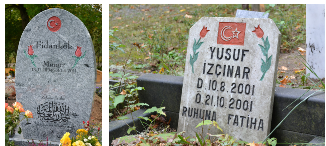
Figures 4 and 5: Graves featuring Turkish Flags and Islamic referents. Note that the grave on the right is for a two-month old baby.

Among the different nationalities represented within Berlin's Islamic burial sections, the Turkish flag appears far more frequently than others. While only 10 percent of the tombstones surveyed included flags, 90 percent of these were Turkish flags (see figures 4 and 5). One could read this as a sign of greater (real or aspirational) nationalist sentiment among Berlin's Turkish population or as a strategy used by Turkish Muslims to distinguish themselves from other national groups. Skeptics might argue that the existence of a Turkish flag in a German cemetery evinces a lack of integration or assimilation to the dominant culture. Yet, there is a certain ambivalence at play, given that the deceased is buried in Germany and hasn't been repatriated to Turkey for burial. While the flag might be Turkish, the body remains in Germany and serves as an anchor and reference point for future generations. Like the practice of marking a foreign birthplace, the flag simultaneously acknowledges a migratory history and the reality of the community's presence in a new land.