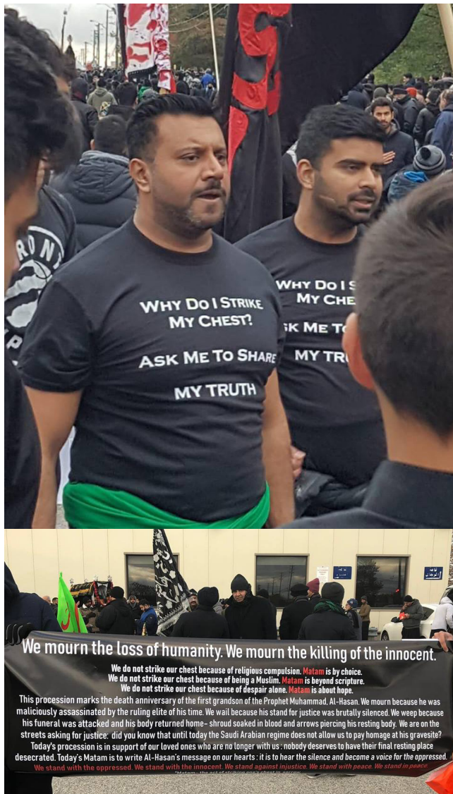
Image 2: A Toronto initiative to educate about ritual commemoration developed in reaction to public criticisms of matam .

or posted decontextualized videos online as a means of stirring up controversy. 19 Certain clerics have also made a name for themselves by criticizing the practice in their sermons. This has, in some cases, prompted responses from practitioners of matam eager to defend the practice. As a reaction to the proliferation of criticisms of matam in and around Toronto, for instance, matamis in the city created banners and t-shirts aimed at debunking misconceptions of matam as a barbaric or threatening practice (Image 2).