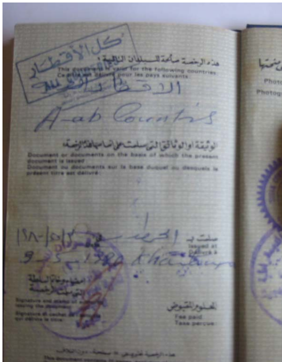
Figure 1: CTD of Eritrean Refugee for Arab Countries

After independence, the Eritrean government chose to break with the pro-Arab trends of ELF-led guerrilla diplomacy. The EPLF, the rather pro-Western guerrilla front that took over the guerrilla in the 1980s and eventually achieved independence in 1991, bent the Eritrean foreign policy towards Western and African alliances, including new diplomatic ties with Israel at the beginning of the 1990s. (Shafî‘â 2003)