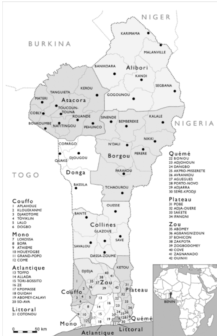
Map 1: Administrative map of Benin