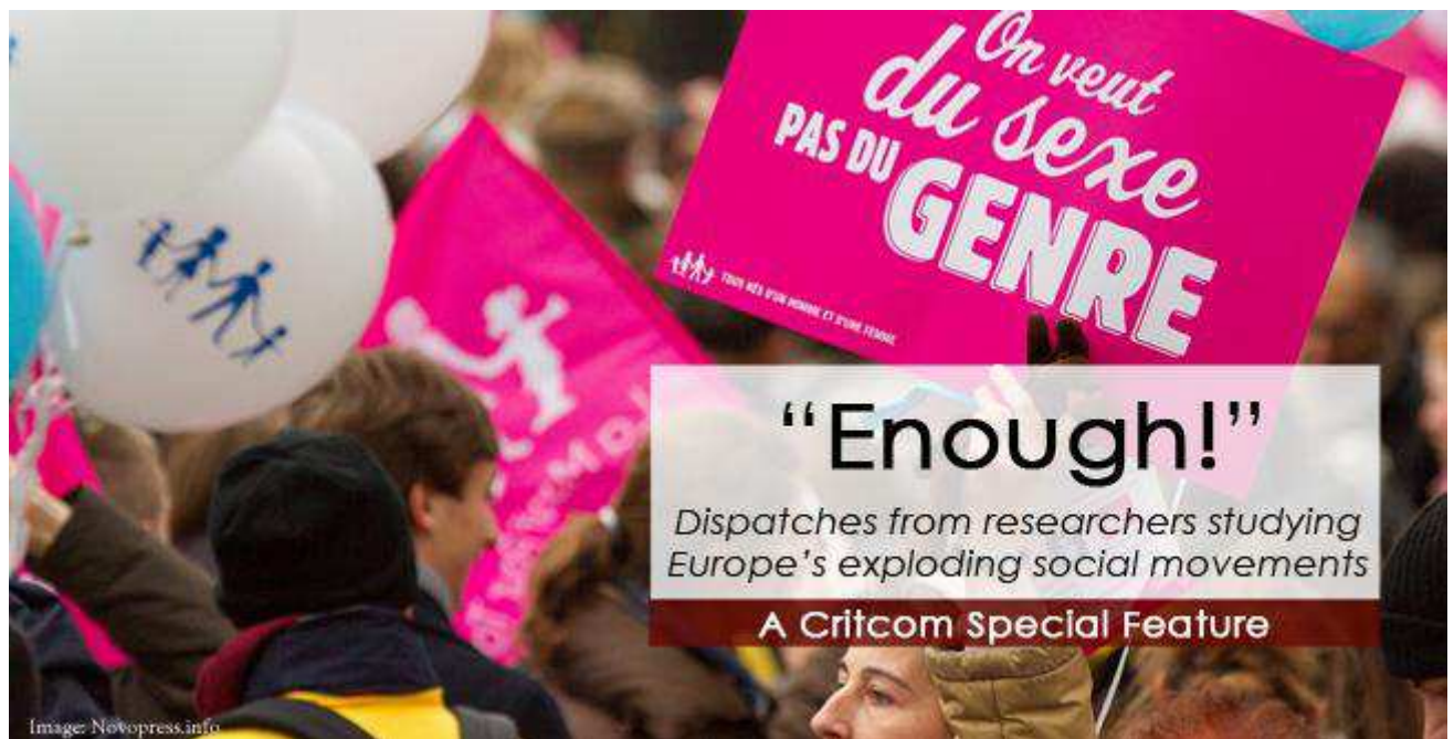
Click on the images below to navigate the articles in this special feature.

Share on facebook Share on twitter Share on email Share on print More Sharing Services 6