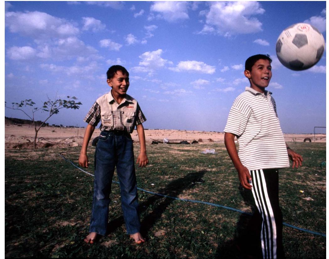
IMAGES FROM PALESTINE Two boys play soccer on a field in Rafah under the eye and barrel of Israeli sniper towers. Several children have been killed by sniper fire on this field. A few minutes after this shot was taken, Israeli snipers opened fire at the ground, sending everyone scurrying for cover.

After the 1993 signature of the Oslo Declaration of Principles between Israel and the