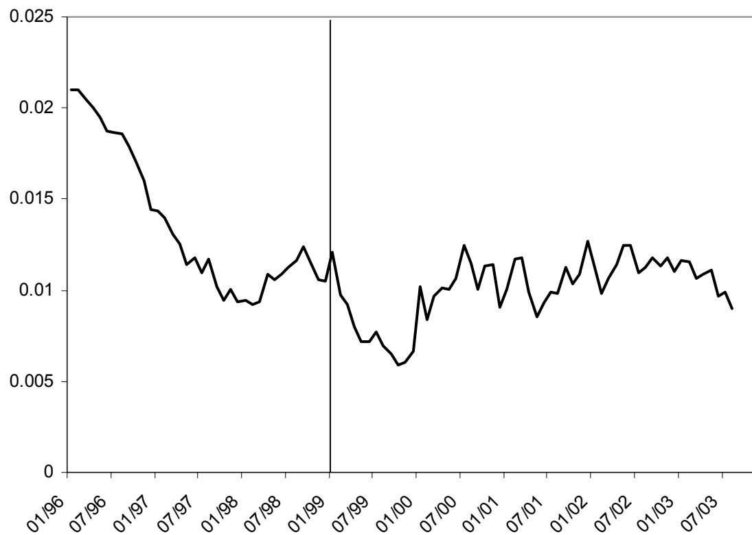
Figure 2: Standard deviation of unweighted inflation rates in the 12 Euro zone countries