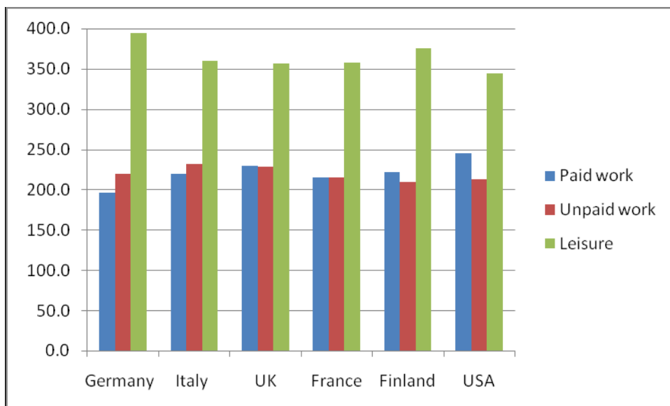
Figure 3- Housework, paid work and leisure Minutes per day and person, latest year available*

Note. Using normalised series for personal care; Unites States: 2005, Finland 1998, France 1999, Germany 2002, Italy 2003, United Kingdom 2001.